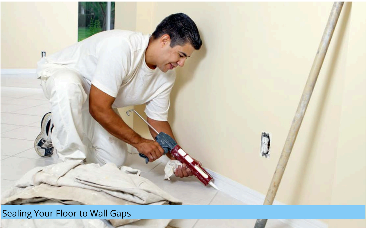
Sealing Your Floor to Wall Gaps

Click here for EPA'S guide to radon-resistant construction